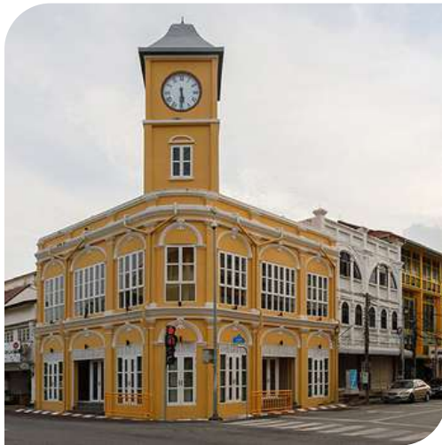
Century Sino Portuguese Old Building